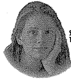
SHARING THE GOOD NEWS