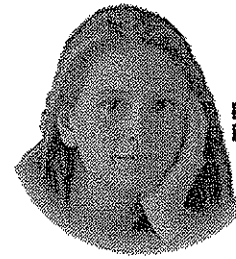
FRIENDSHIP: A PRICELESS GIFT