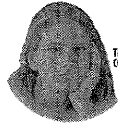
THE GREAT COMMISSION